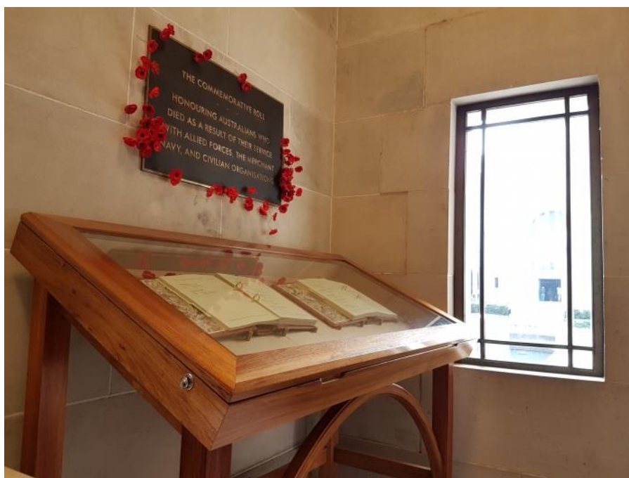
Commemorative Roll