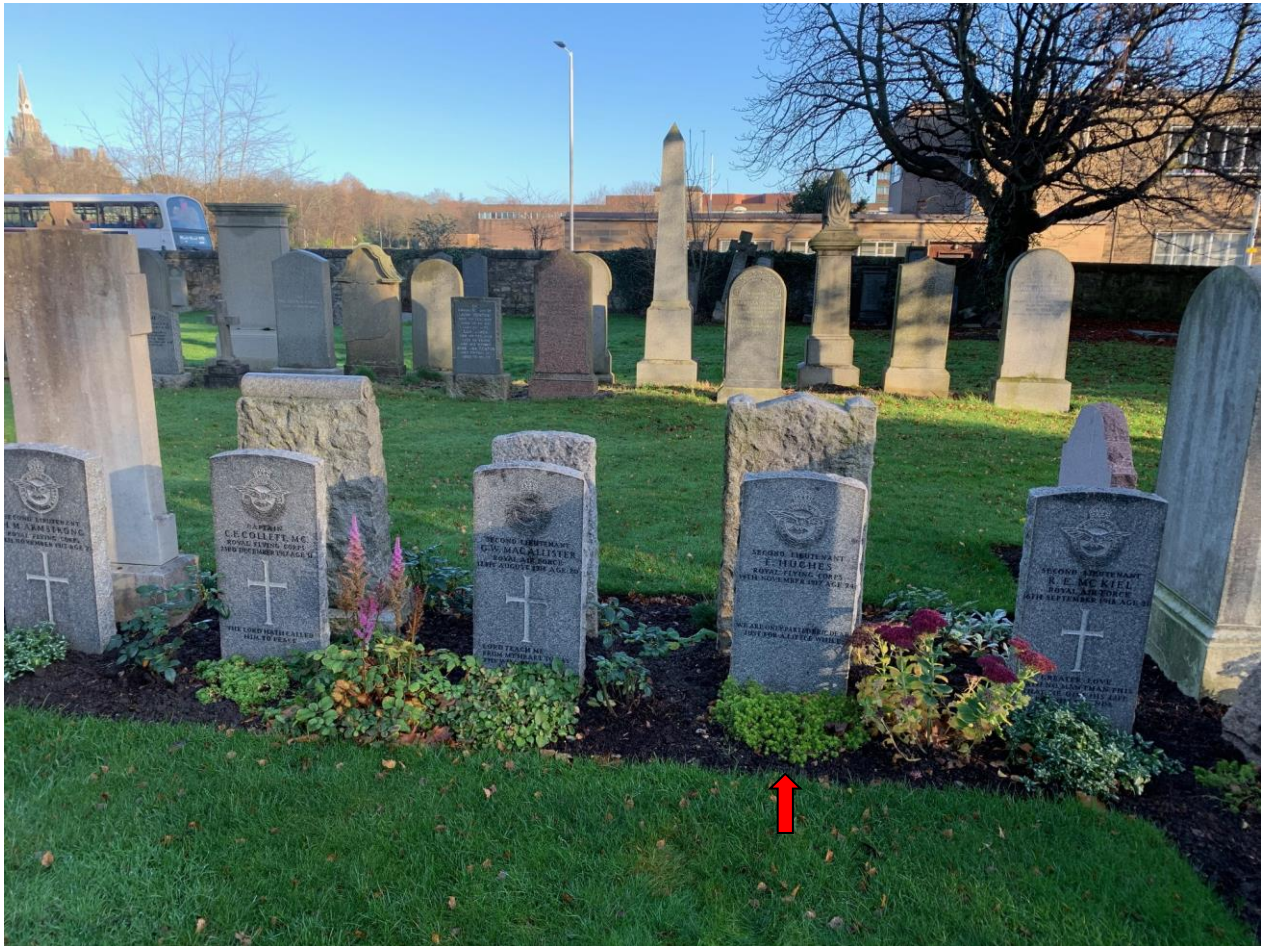
Second Lieutenant E. Hughes' CWGC Headstone (red arrow)