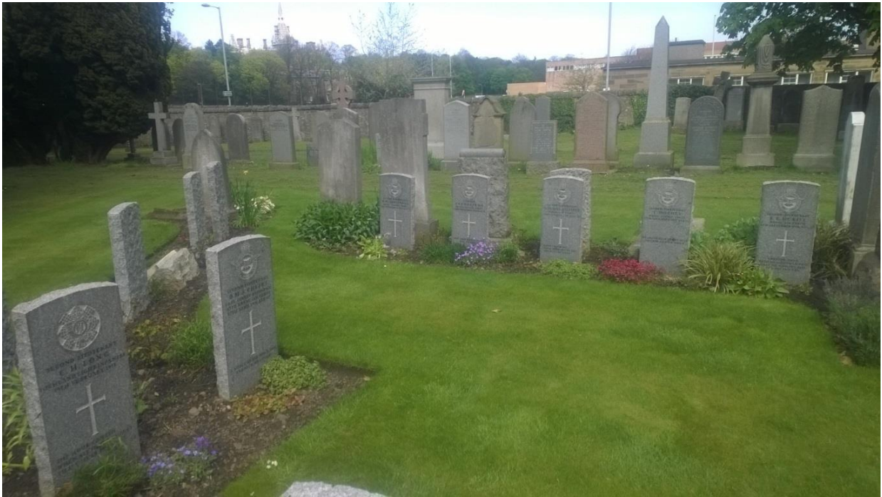
Comely Bank Cemetery, Edinburgh, Scotland